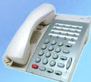
DTU-16 16-Button without Display