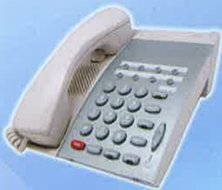
DTU-8 8-Button without Display