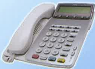
DTR-8D-1R 8-Button with Display (white only)