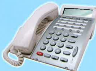
DTU-16D 16-Button with Display