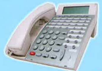
DTU-32D 32-Button with Display