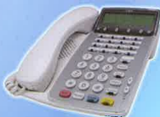
DTR-16D-1R 16-Button with Display (white only)