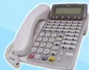
DTR-32D-1R 32-Button with Display (white only)