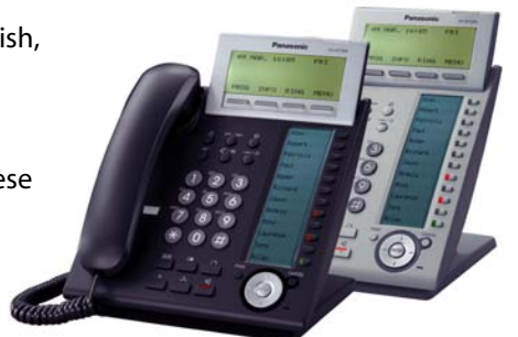
KX-NT300 series IP Proprietary Telephones

The IP telephones offer superb voice quality thanks to handsfree speakerphone and acoustic echo cancellation. The sleek, ultra-modern design, available in both black and white works well with any work environment and office decor.