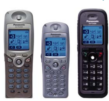
KX-TCA series DECT wireless handsets

The KX-TDE PBX supports wireless mobility solution via an integrated Multi-Cell DECT System. This system provides automatic hand-over between installed wireless cells - enhancing coverage and giving you true communication mobility even across large premises.