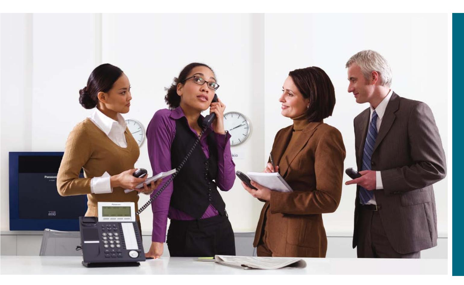
New Panasonic IP PBX. The Rules Have Changed!